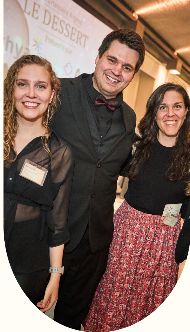
Our scholarship students volunteer for our events!